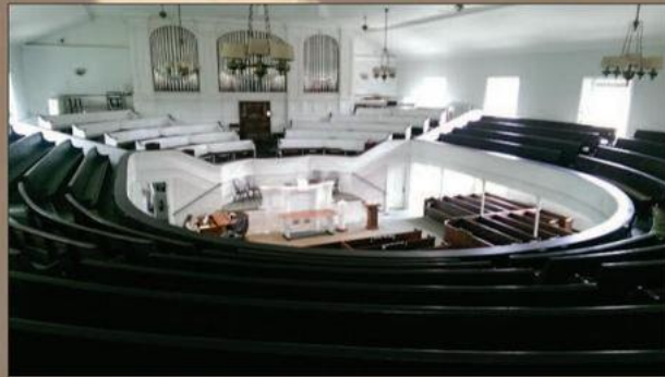
Charles G. Finney Auditorium